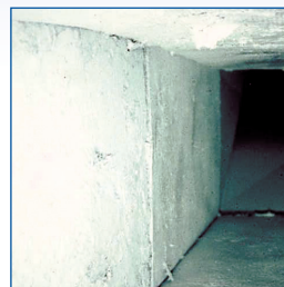
AFTER 10 YEARS